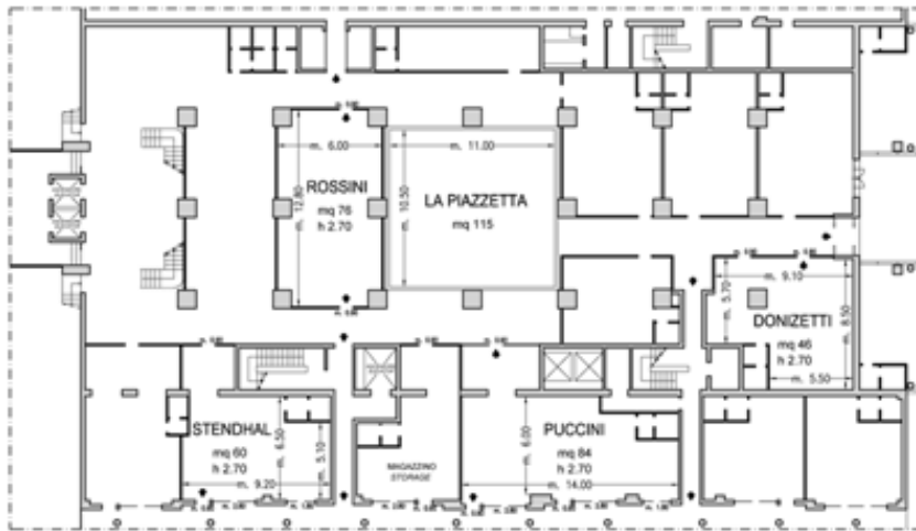
Piano -1 / Basement